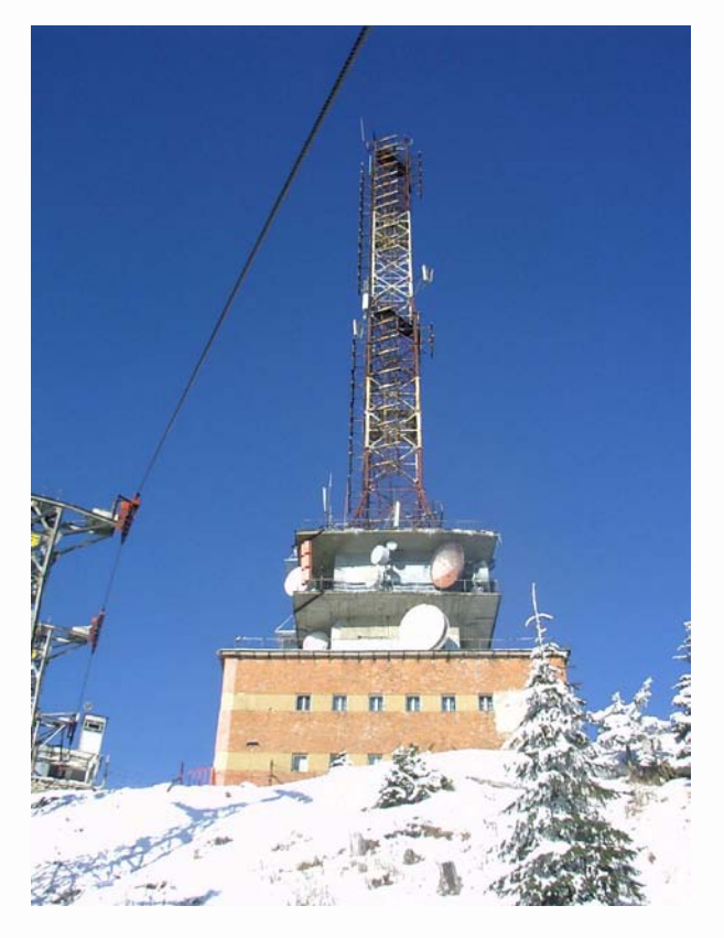
Finally arriving on site a qualified person, or persons, is in charge of reassembly and system installation. In this case a field power measurement will be essential to verify that the reassembly was correct and to validate the original test data.

helicopters and sometimes horse powered carts depending on the transmitter site location. In extreme cases for mountain top installations there is no way for transmitter site access but access by cable car. The picture depicts a site where access consisted of a two mile walk on a washed out logging road which led to a cable car. The cable had a load restriction of less than 800 pounds. Everything had to be uncrated and disassembled beyond normal to meet the weight restrictions of the cable. On the mountain top the transmitter room was up many flights of winding stairs. This equipment received bumps and joggles on a monumental level.