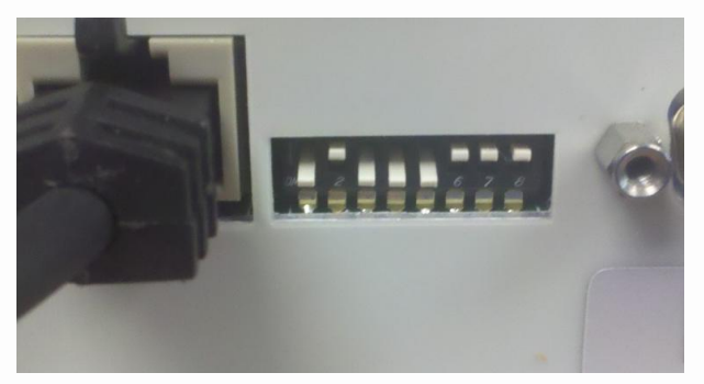
Figure 4: RS-232 Switch Settings

1. Set the switches next to the RS-232 port match the picture below: